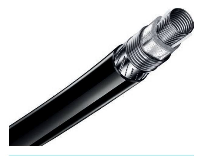
Figure 3. Vacuum insulated flexible pipe.

For island communities embarking on the ambitious task of establishing LNG import infrastructure, the adoption of reeled plug-and-play flexible corrugated stainless-steel pipes